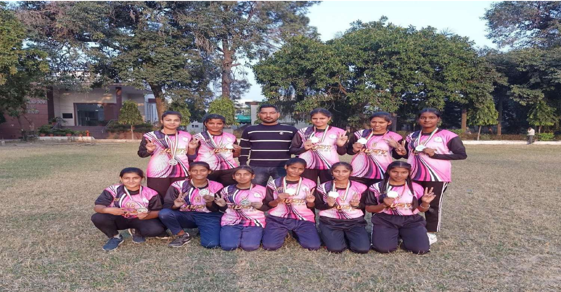
GCG LUDHIANA SECURE 2ND POSITION IN PANJAB UNIVERSITY CHANDIGARH KHO-KHO CHAMPIONSHIP 2021-22