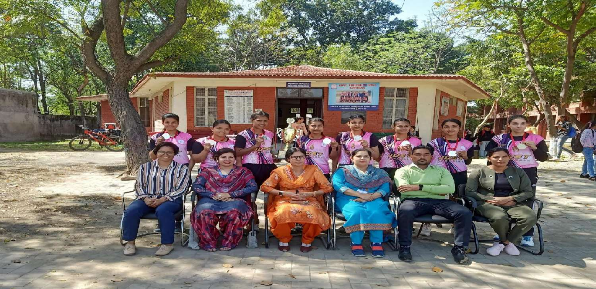
GCG LUDHIANA WON SILVER MEDAL IN PANJAB UNIVERSITY CHANDIGARH HANDBALL INTER COLLEGE COMPETITION 2021-22