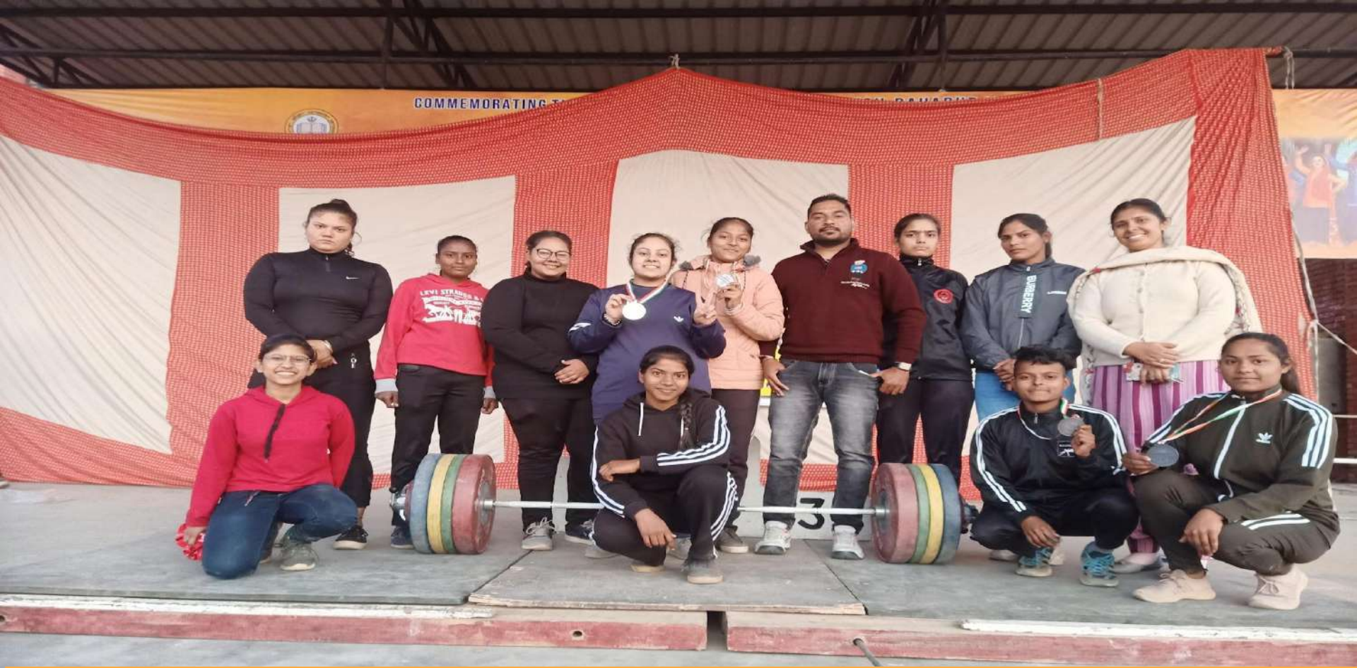
GCG LUDHIANA WON 3 SILVER AND 2 BRONZE MEDAL IN PANJAB UNIVERSITY CHANDIGARH WEIGHT LIFTING INTER COLLEGE CHAMPIONSHIP 2021-22