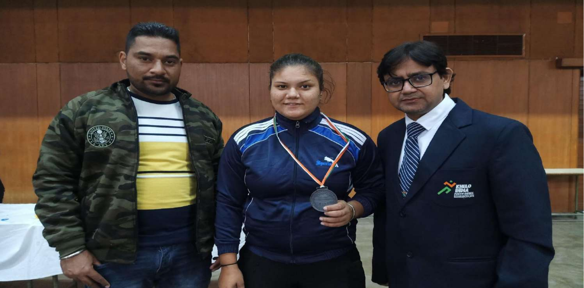
GCG LUDHIANA WON BRONZE MEDAL IN PANJAB UNIVERSITY CHANDIGARH JUDO INTER COLLEGE COMPETITION 2021-22