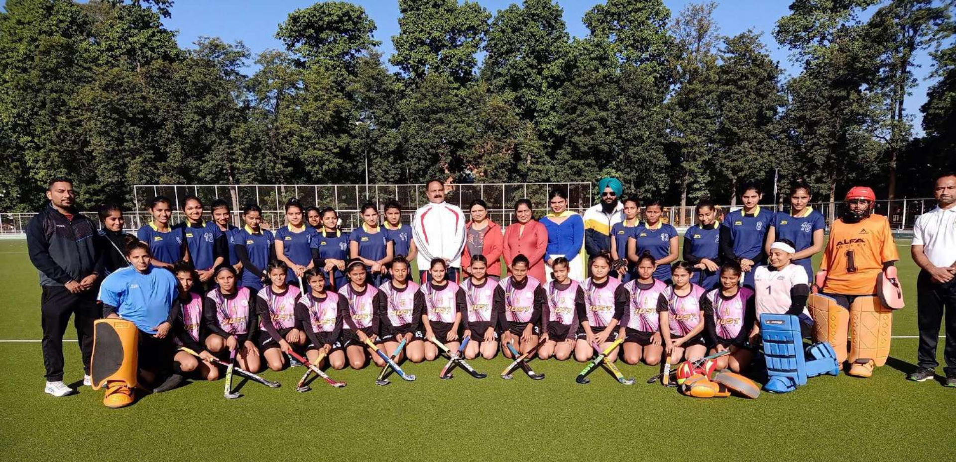
GCG LUDHIANA SECURE 4TH POSITION PANJAB UNIVERSITY CHANDIGARH HOCKEY INTER COLLEGE COMPETITION 2021-22