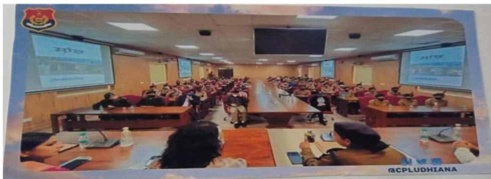
International Women's Day (8 March 2022)