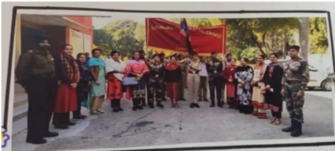
Anti Drug Rally (23 Nov 2019)