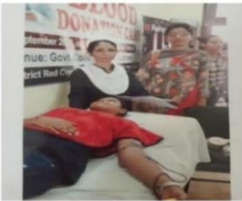
Blood Donation Camp ( 20 September 2018)