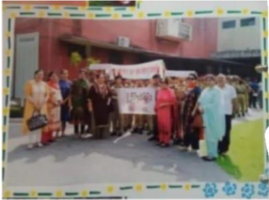
150th Birth Anniversary of Mahatma Gandhi (2 Oct 2019)