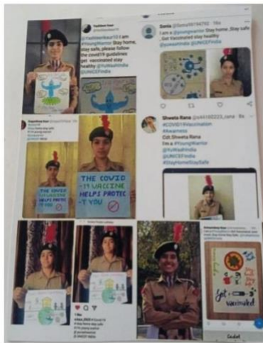
UNICEF Yuwaah Initiative (5 June 2021)