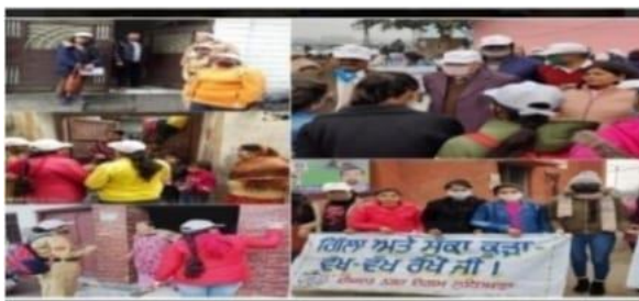
An awareness campaign on cleanliness of Budha Dariya