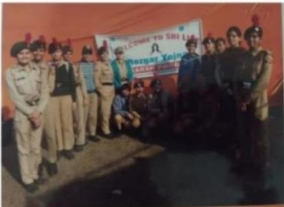
Rozgar Mela ( 22 February 2019 )