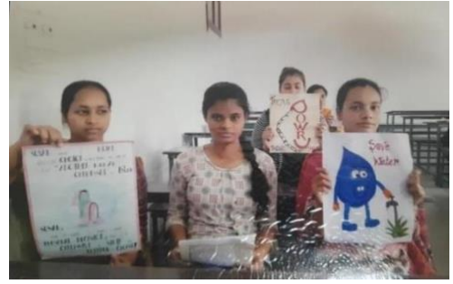
Poster Making on ‘Social Evils’