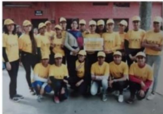
Anti - Drug Campaign ( 18 February 2019)