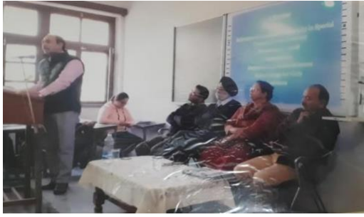
Lecture on ‘Relevance of Gandhian Philosophy’