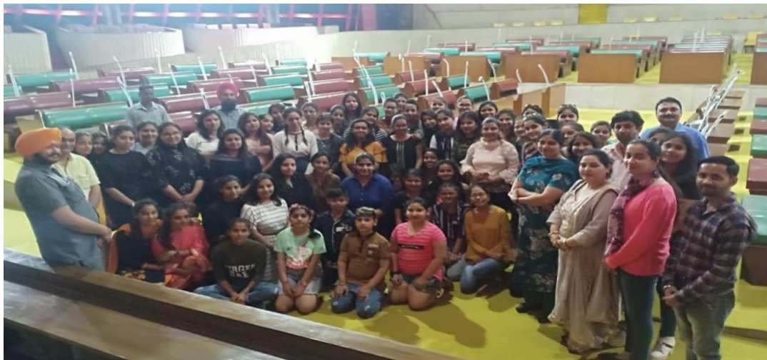
Educational tour to Panjab Legislative Assembly(April 2018-19)