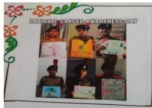
National Cancer Awareness Day (7 Nov 2020)