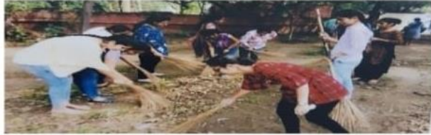
Swachh Bharat Abhiyan ( 17 April 2017 )