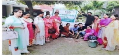
Van mohatsav (2019)