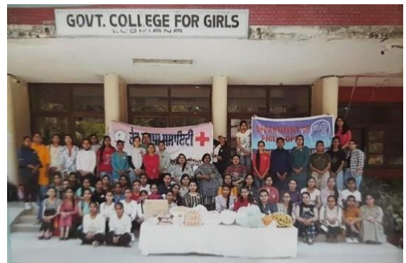
Visit to old-age home in collaboration with Red Cross Society