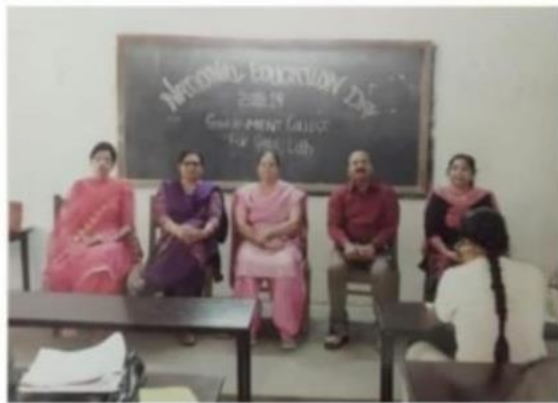
National Education Day ( 12 November 2018 )