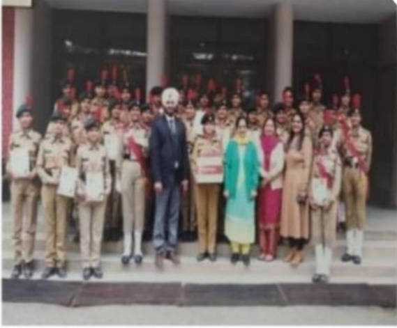
Run For Humanity ( 12 March 2017)