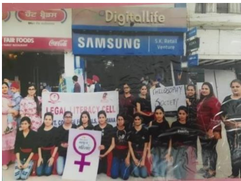
Nukkad Natak in collaboration with Legal Literacy Cell on the topic ‘Mehfooz Nahi Mahilayein’