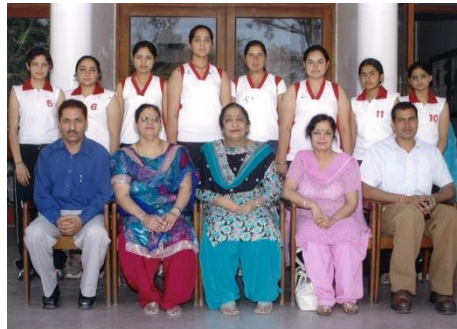
Kabbadi Team 3 rd in Panjab University Session 2007-2008.