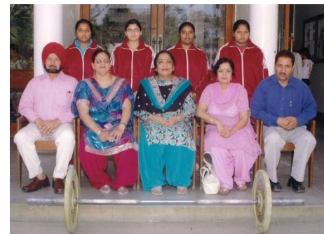
Weight Lifting team 1 st in Panjab University session 2007-2008.