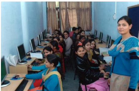
Add on Course Commerce computer based accounting classes starts.