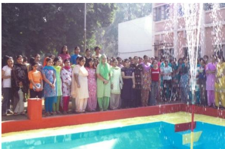
Inauguration of fountain in front of hostel.