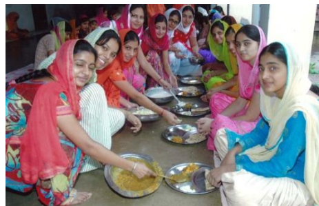
Sehaj Path and Langar (Guru Nanak Dev Ji Birthday)