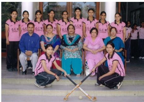
Hockey Team 3 rd in Panjab University, Inter College Competition session 2007-2008.