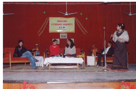
An English play by English literary society G.C.W.