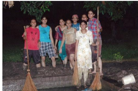
Students cleaning the water tank in front of hostel.