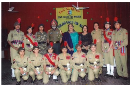
Out Standing N.C.C. Cadets