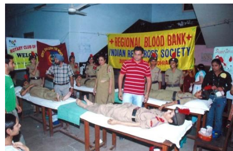
N.C.C. Cadets Donatry Blood Dung Blood Donation Camp on 07-09-2007.