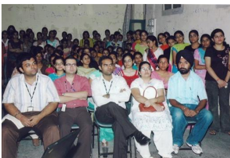
Placement Cell IBM-Daksh team during IBM Campus Placement drive.