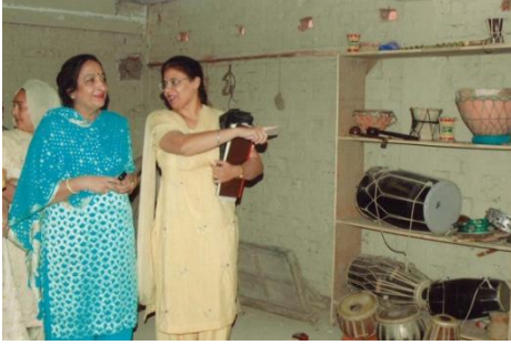
Another Scene of Heritage village at G.C.W.