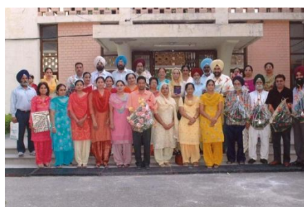
Kavi Darbar: Staff with eminent poets