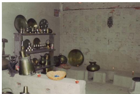
Scene of Heritage village at G.C.W.