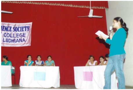
Quiz organized by Political Science Society.