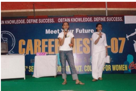
Career fest 2007