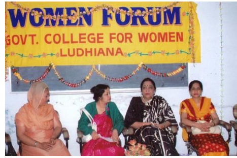
College celebrating International Women's Day