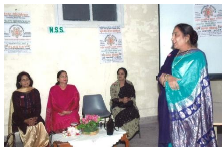
Strengthening peelings or communal harmony by celebrating flag day. – N.S.S. Unit G.C.W.