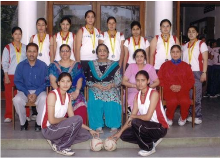
Hand Ball team 3 rd in Panjab University session 2007-2008.