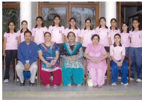
Kho-Kho Team 2 nd in Panjab University session 2007-2008.