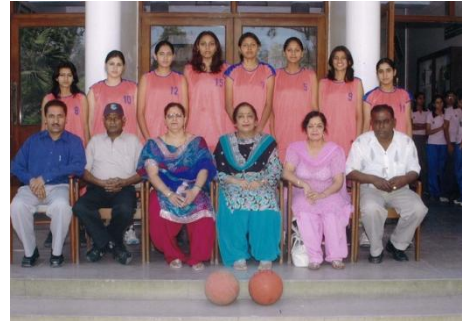
Basket ball team 1 st in Panjab University session 2007-2008.