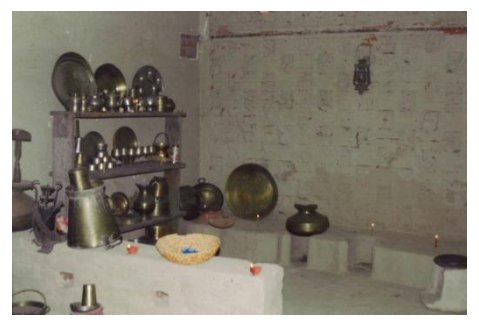
Scene of Heritage village at G.C.W.