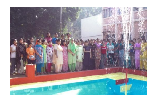
Inauguration of fountain in front of hostel.