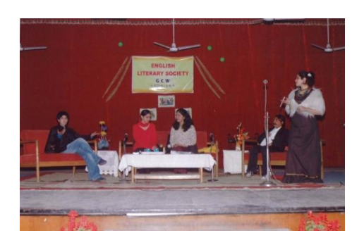
An English play by English literary society G.C.W.