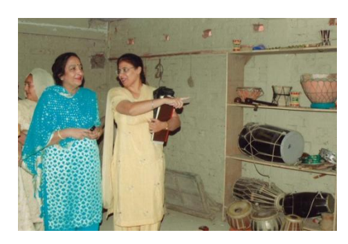
Another Scene of Heritage village at G.C.W.