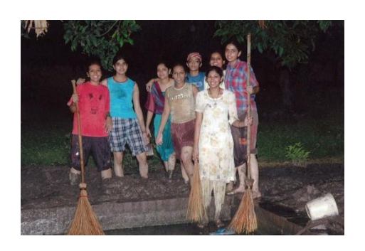
Students cleaning the water tank in front of hostel.