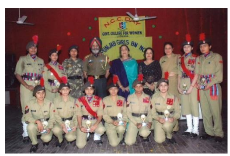
Out Standing N.C.C. Cadets