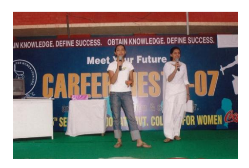
Career fest 2007