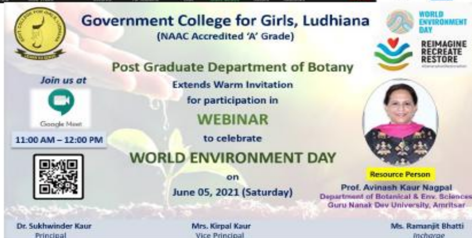
Webinar and Plantation drive to celebrate World Environment Day