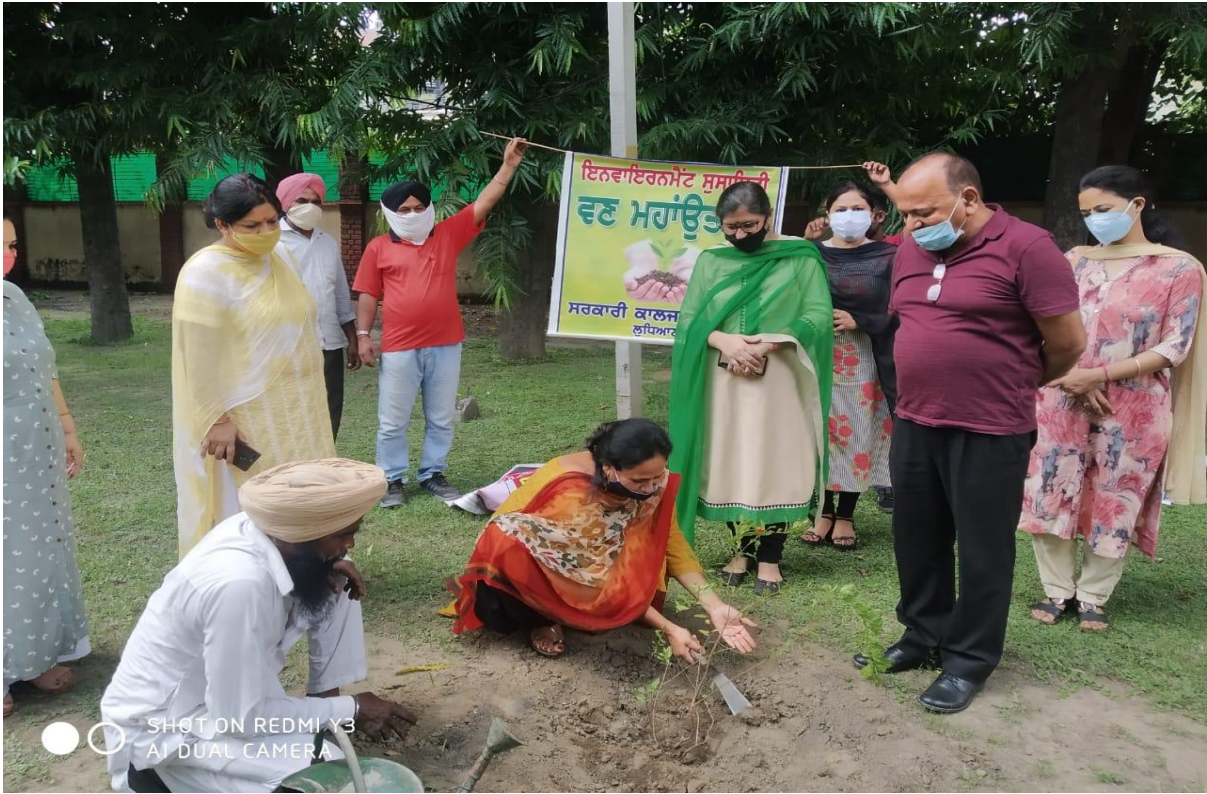
Van Mahotsava celebration by the Environment Society of the college