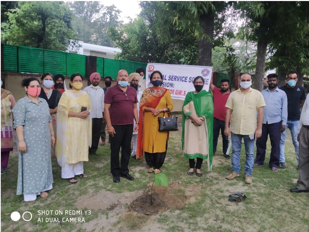
Plantation by the NSS unit of the college