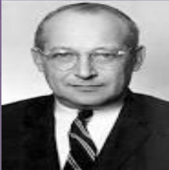
WALT WHITMAN ROSTOW